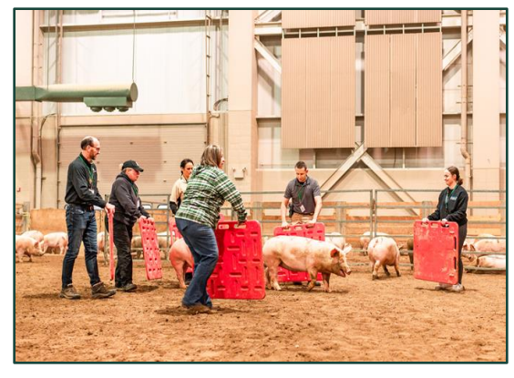
ERAIL training participants maneuvering pigs